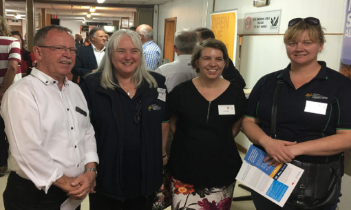
Morning Tea Gathering: Above Balaklava and Below: Port Broughton