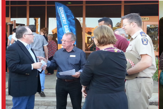
Meeting prior to the gathering at Port Pirie and Below: VIRTUS Soccer Club Funding Announcement $208K