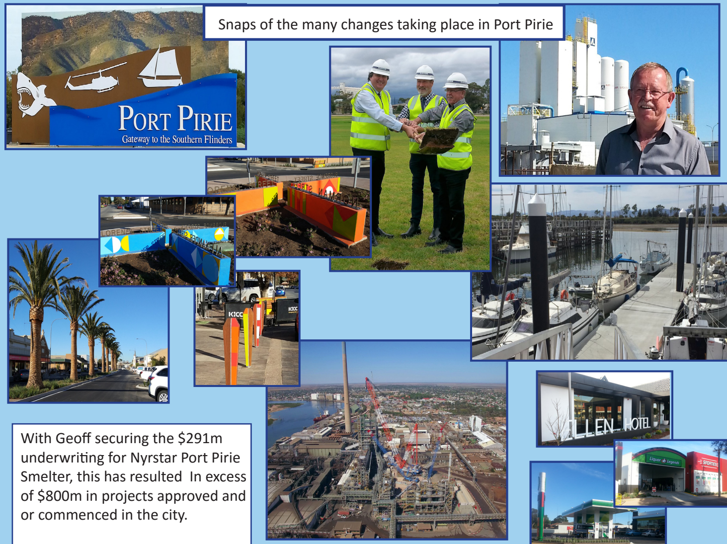
Snapshots of the many changes taking place in Port Pirie