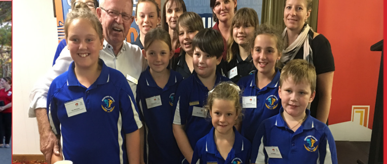
Snowtown Primary School visit Balaklava for the community morning tea gathering.